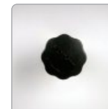
Manual Steam Valve